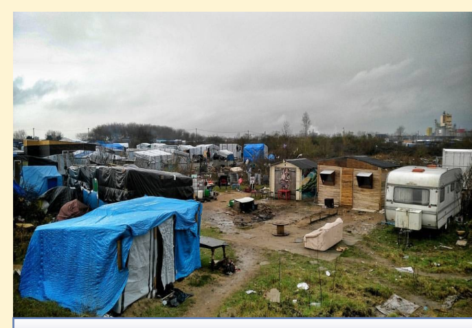
Calais (France), Ph. Valerio Nicolisi

Against the background of the different national experiences of providing medical treatment to refugees, in particular during the migration waves in 2015, the CPME Board has adopted a statement which puts fundamental rights and medical ethics at the heart of the debate. To ensure effective access to healthcare for every refugee, CPME proposes to integrate them into the existing healthcare systems. This ensures equal treatment and avoids the administrative burdens a parallel system would entail. The principle of equality is also reaffirmed in relation to the patient-physician relationship and the right to confidentiality. As provided for in codes of medical ethics, doctors have professional obligations to maintain patient confidentiality and to act in the best interest of the patient. They may not be pressured into breaching this and are encouraged to